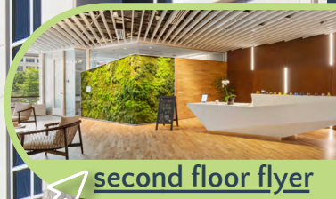
second floor flyer