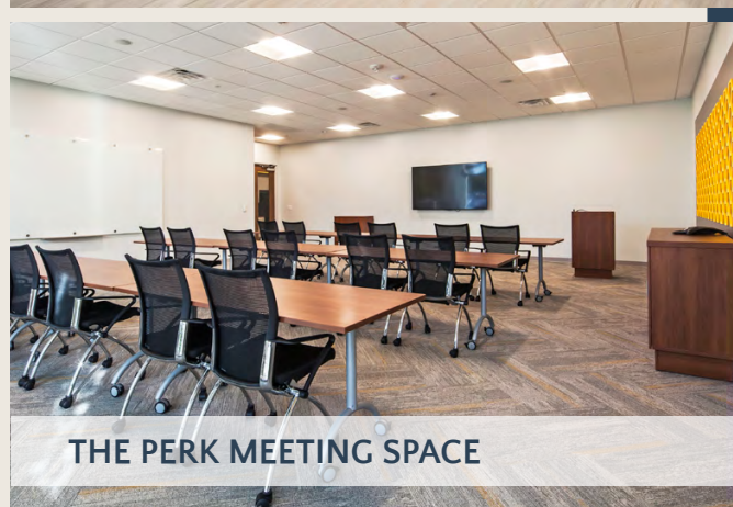
THE PERK MEETING SPACE

1700 Perimeter Park enjoys easy access to the abundant amenities within Perimeter Park.