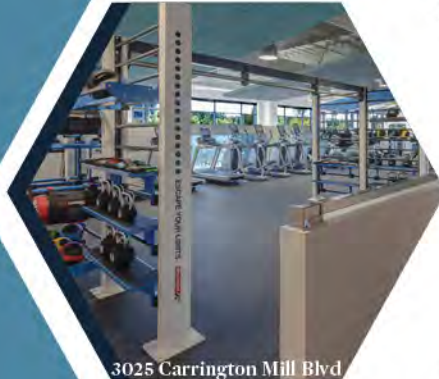
3025 Carrington Mill Blvd

For questions, reach out to customerservice@trinity-partners.com