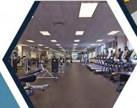
3800 Paramount Pkwy